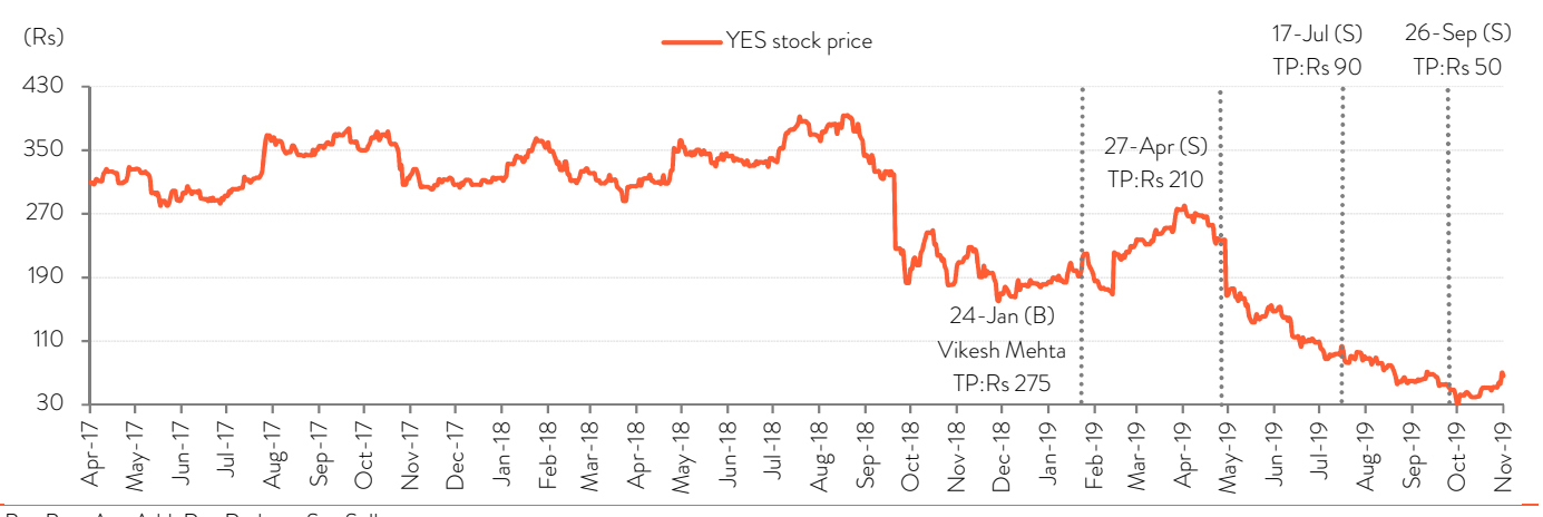
B - Buy, A - Add, R - Reduce, S - Sell