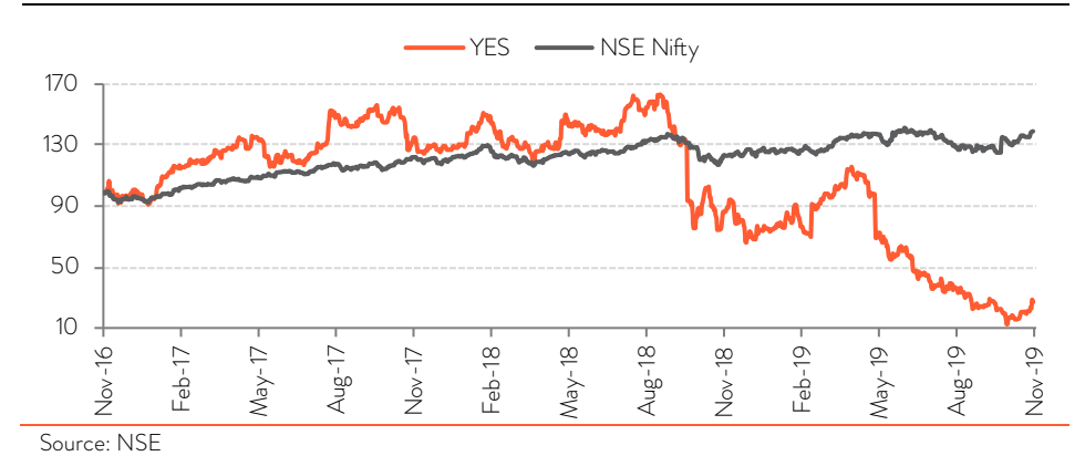
FIG 4 - RELATIVE STOCK PERFORMANCE