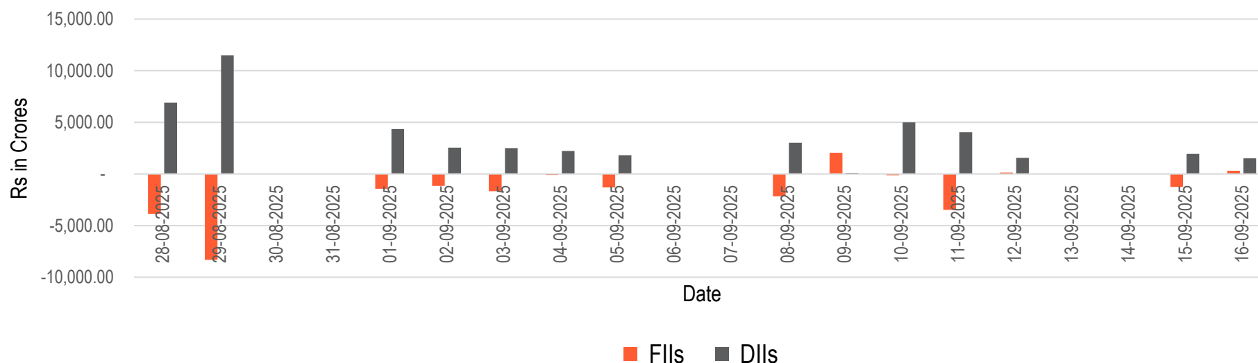
Institutional activity of last 14 trading sessions.