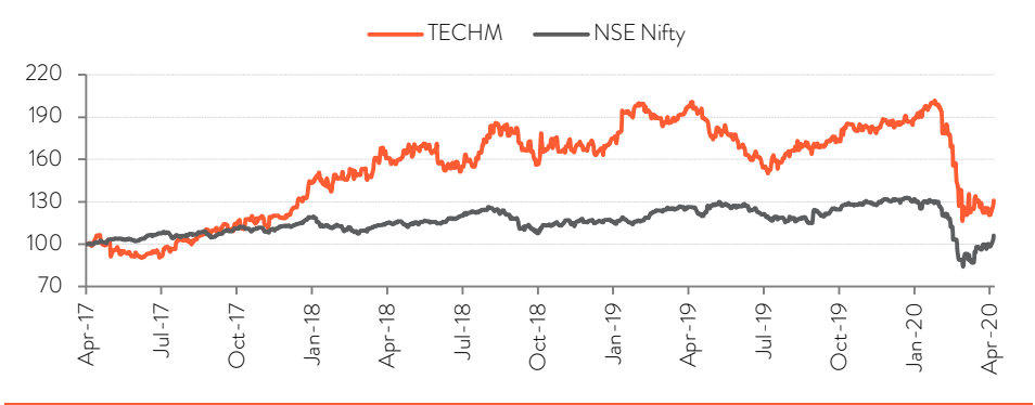
FIG 4 – RELATIVE STOCK PERFORMANCE