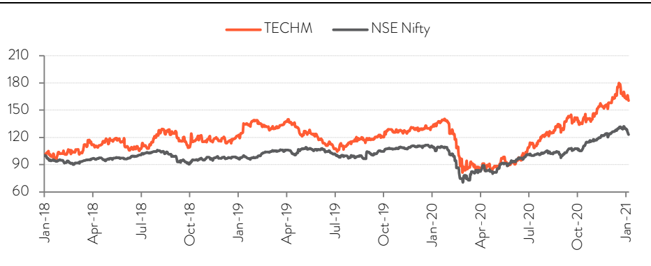
FIG 4 - RELATIVE STOCK PERFORMANCE