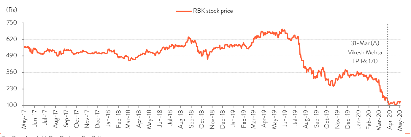
B - Buy, A - Add, R - Reduce, S - Sell