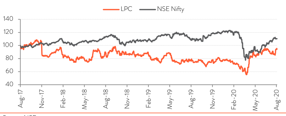
FIG 4 - RELATIVE STOCK PERFORMANCE