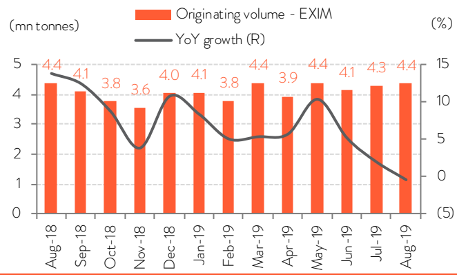
FIG 5 – EXIM VOLUMES WERE FLATTISH AT 0.5% YOY