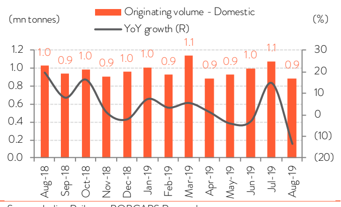
FIG 6 - DOMESTIC VOLUMES DROPPED 13.6% YOY

Total lead distance declined marginally by 0.8% YoY to 868km