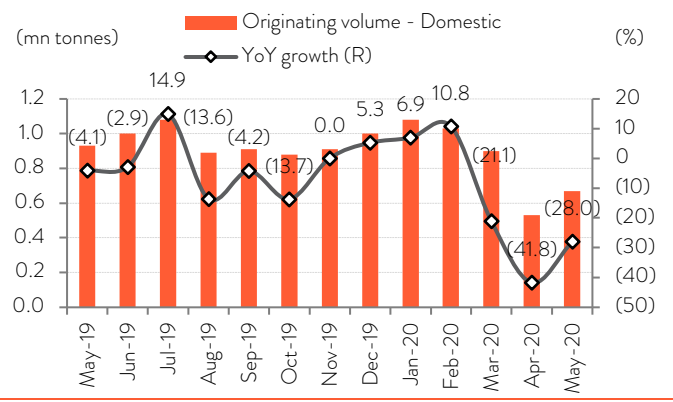
FIG 6 – DOMESTIC VOLUMES FELL 28% YOY