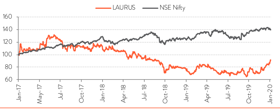
FIG 4 - RELATIVE STOCK PERFORMANCE