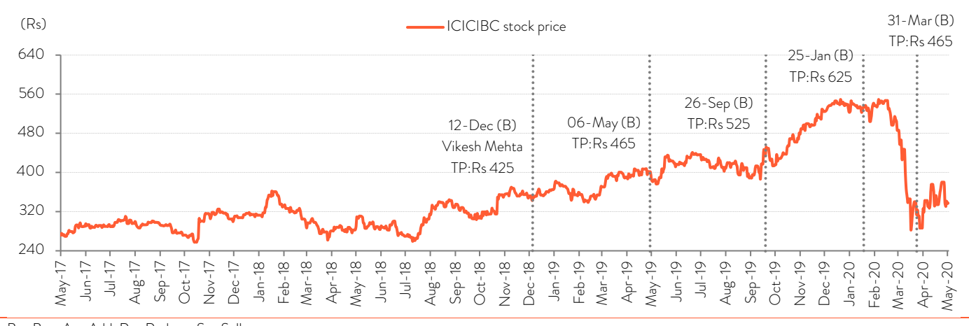
B - Buy, A - Add, R - Reduce, S - Sell