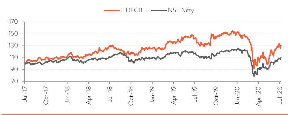
FIG 3 – RELATIVE STOCK PERFORMANCE