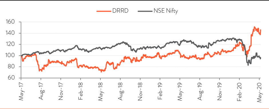
FIG 4 - RELATIVE STOCK PERFORMANCE