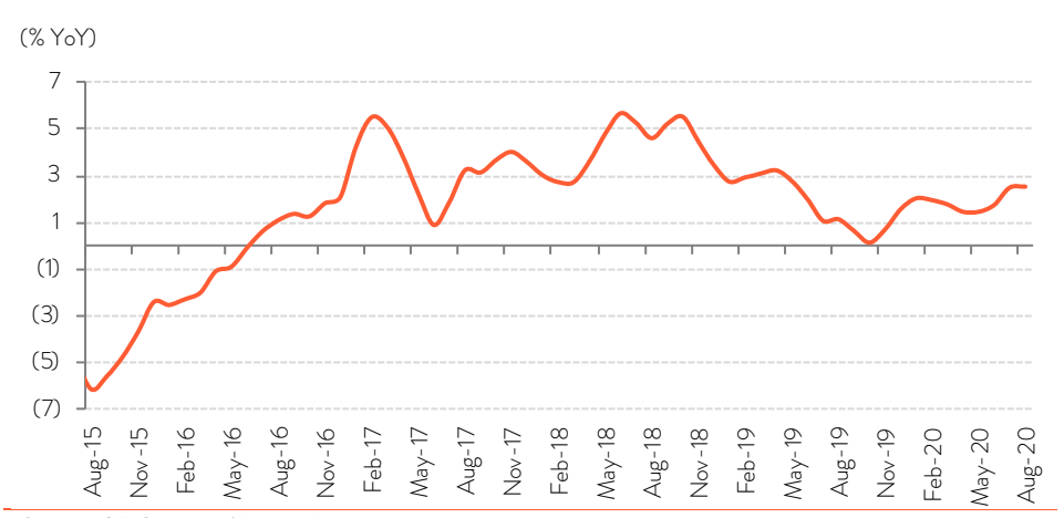
FIG 3 - HEADLINE WPI TO PICK UP IN THE COMING MONTHS