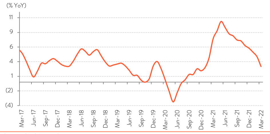
FIG 3 - HEADLINE WPI TO REMAIN ELEVATED IN H1FY22