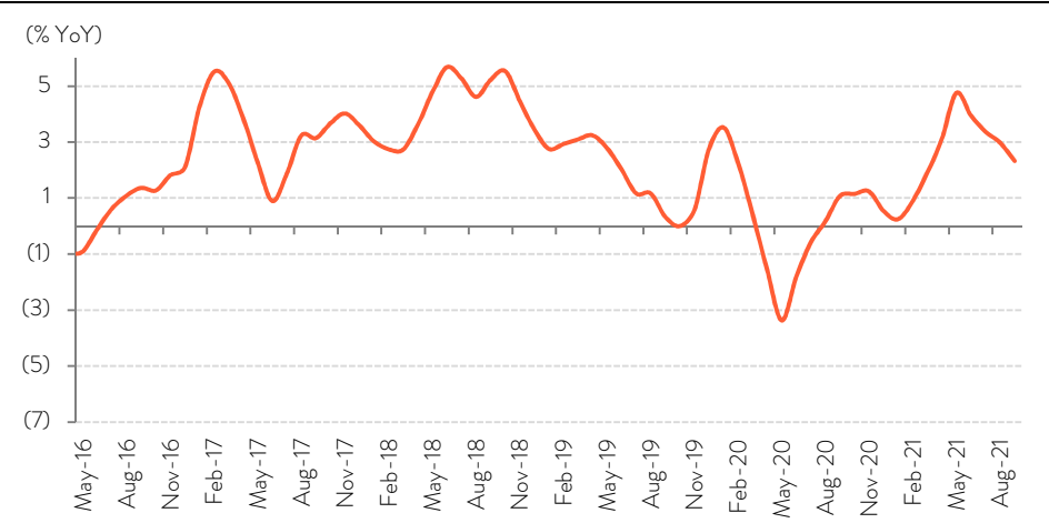
FIG 3 – HEADLINE WPI TO INCREASE IN Q1FY22 ON LOWER BASE BEFORE EASING