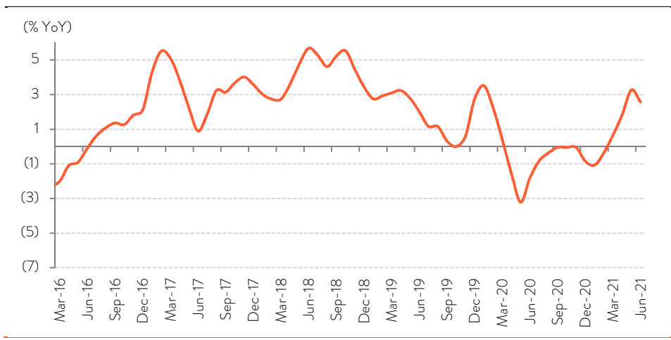
FIG 3 - HEADLINE WPI TO PICK UP IN THE NEAR-TERM