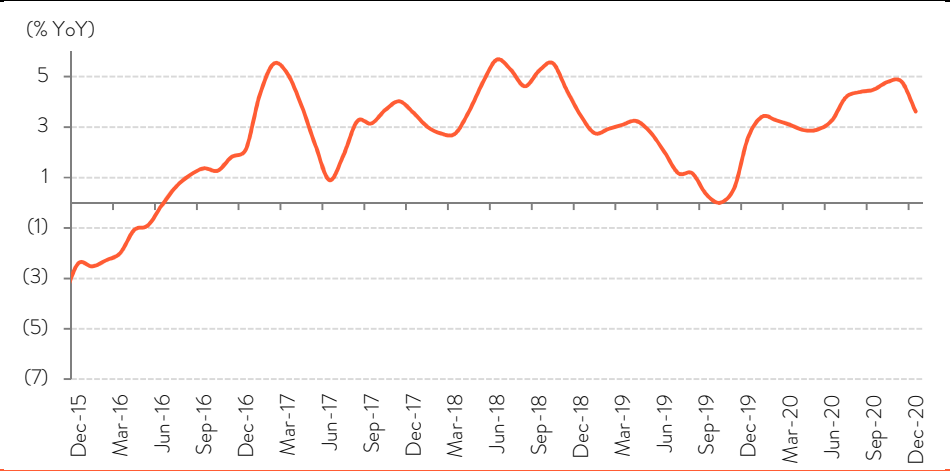
FIG 3 - HEADLINE WPI TO REMAIN HIGH IN Q4FY20