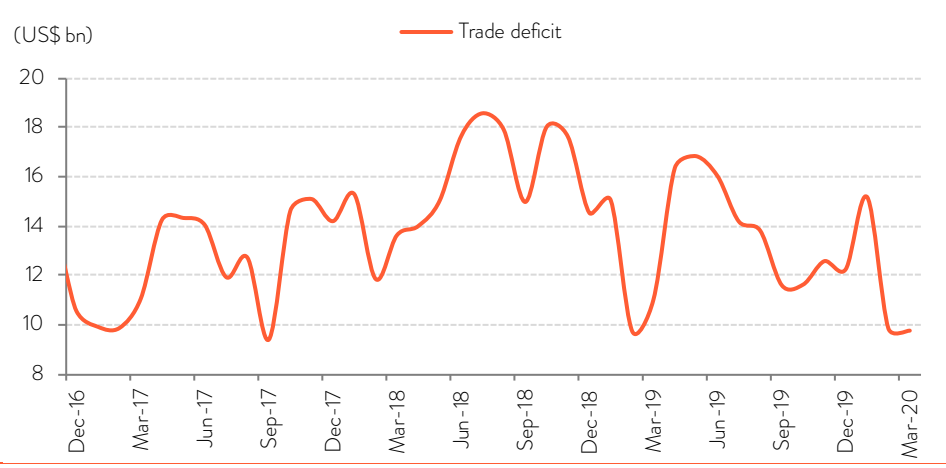
FIG 3 - TRADE DEFICIT REMAINS STABLE IN MAR'20