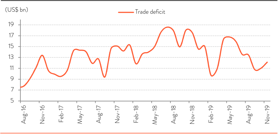
FIG 3 – TRADE DEFICIT WIDENS TO US$ 12.1BN