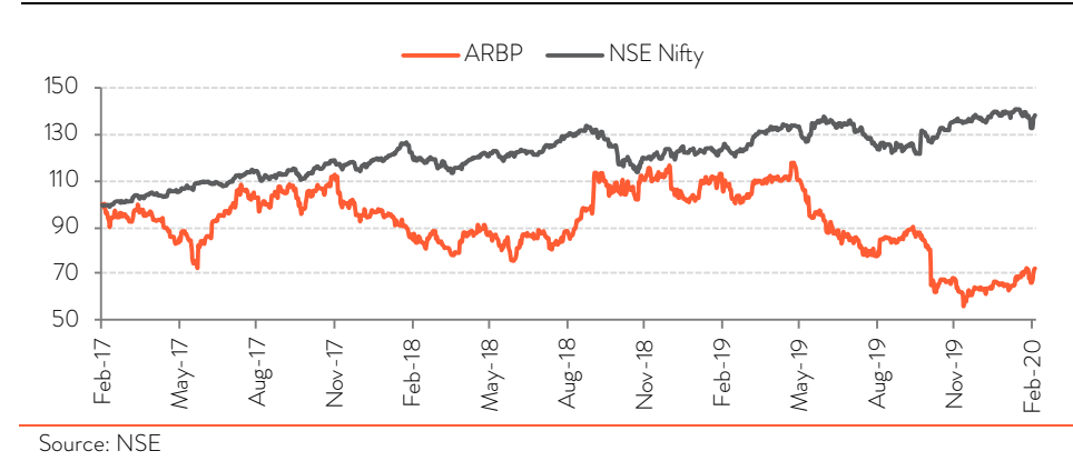
FIG 4 – RELATIVE STOCK PERFORMANCE