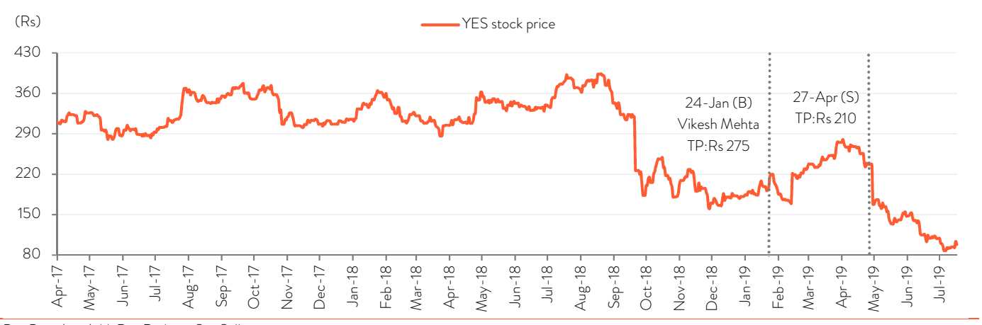
B - Buy, A - Add, R - Reduce, S - Sell